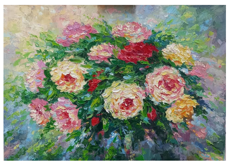
Impressionism Flowers, Arman Asatryan 1976-